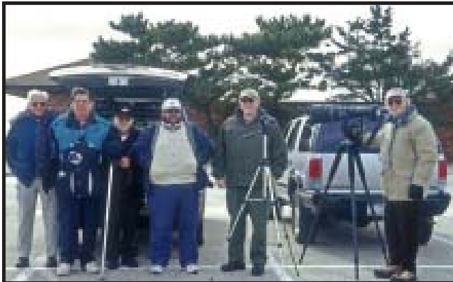
Some of the IPG members who participated in the News12 Long Island interview.