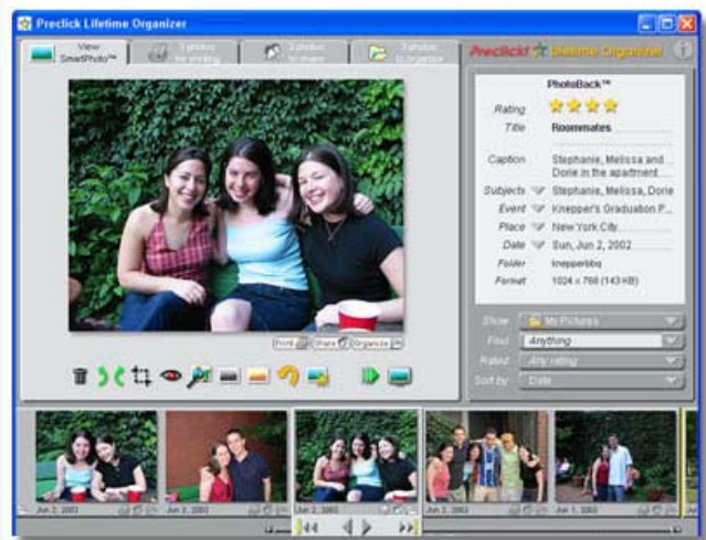
Screenshot of Preclick! Digital Photo Organizer

The program can be upgraded to the Lifetime version for a nominal fee of $19.95, or used indefinitely in the free version.