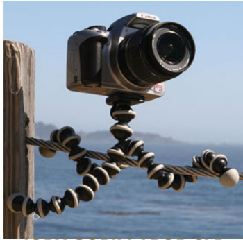
JOBY GORILLAPOD SLR

There are three Gorillapod models, the original Gorillapod for small point and shoot cameras, the