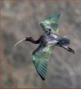
Submitted by Mike Ginex

So you say you're serious about your Digital Photography? If you are, you know that having the right tools makes all the difference in the world. In your tool bag, you already have the right camera, computer and software, but once you have tried this tool you will be absolutely amazed and hooked! It might look a bit unusual, but believe me, using this device is absolutely the most natural way to work on your digital photos.