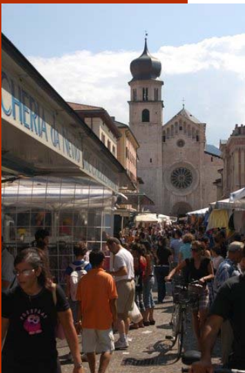
Submitted by Joe Prantil

This Intuos3 series of tablets have 1024 levels of pressure sensitivity.