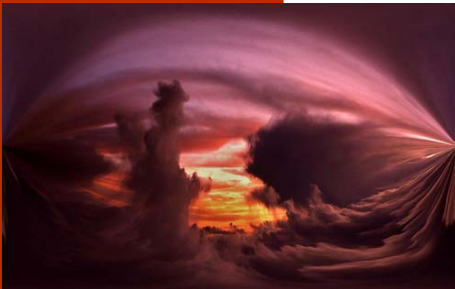
RED SKY

If you are in the market for any photo travel gear you should definitely consider checking out http://thinktankphoto.com/