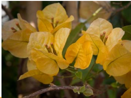
Bougainvillea As Shot