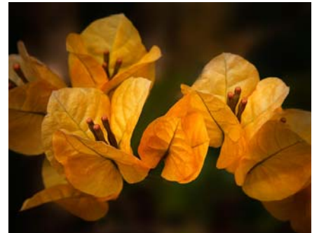
Bougainvillea After Digital Darkroom